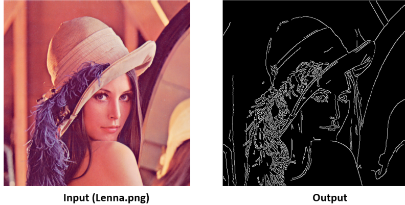
Figure 1: Canny edge detector with Lenna

We will use Sobel filter to approximate the image gradient – x-derivative \frac{\partial I}{\partial x} and y-derivative \frac{\partial I}{\partial y} . Then, we can obtain the magnitude \mathbf{M} and the orientation \mathbf{D} of the gradient as: