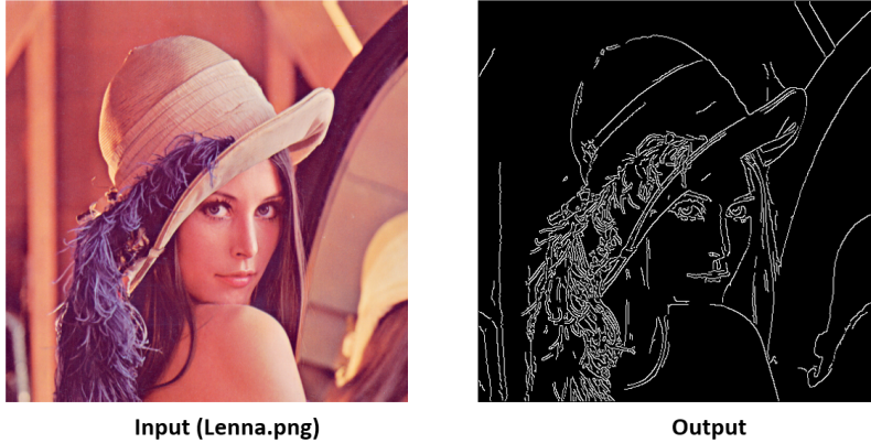
Figure 1: Canny edge detector with Lenna